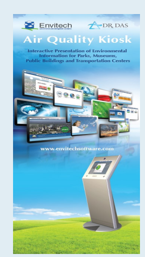
The Kiosk Application Helps Deliver Environmental Awareness Stories to Park Visitors

Phone Apps—With the launch of the Envista API (which will also drive data to the AQ Kiosk and parts of the HTML5 Web Site), we will also supply phone apps (iTunes, Google Play, Windows Store). Custom Apps can be developed for our clients looking to expand their use of mobile technology.